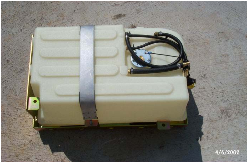
Tank out of box

111 West Aviation Road Fallbrook CA 92088 Phone: 760.731.9434 Fax: 760.723.7596